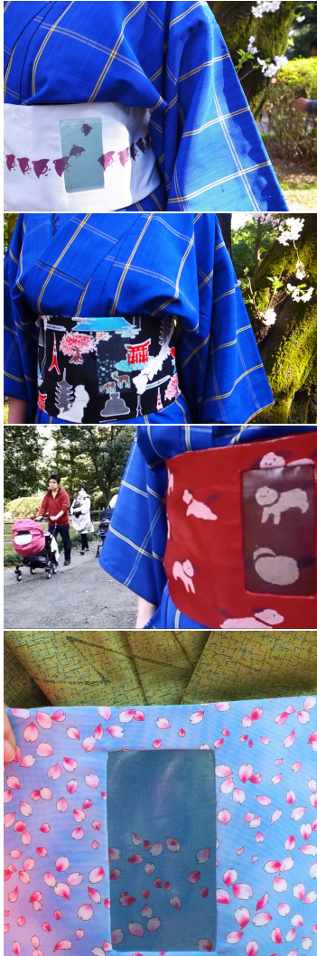
Figure 5: The four new designs pictures from the animation view.

and big problem. One user stated that since she got a new phone (Samsung Note), it got particularly bad as it is too large to fit comfortably into a normal Obi. After showing them the initial prototype and them trying it, all users liked the idea and preferred the Enhanced Obi to the old counter part.