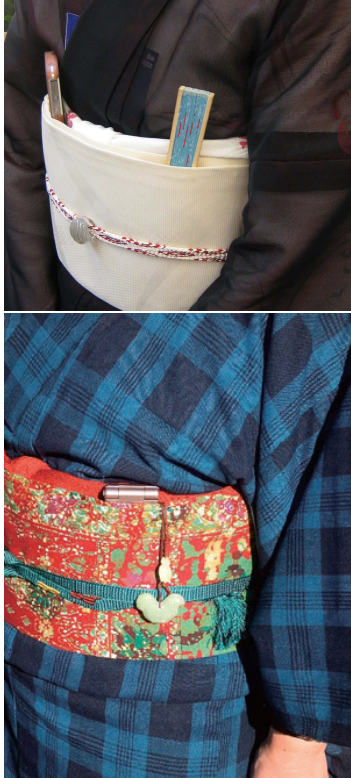
Figure 1: Usual method to carry a mobile phone while wearing Japanese traditional clothes (Yukata and Obi).

countries history and tradition doesn't only shape the past and history of the country but is an important key to its development in the future. In our research agenda, we want to combine traditional arts and crafts aesthetics within modern design techniques to preserve tradition and maintaining diversity in culture, craft, arts while envisioning new augmentation/interaction techniques.