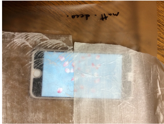
Figure 3: Trying different display panel covers, left the acrylic glass we ended up using.

After the initial 4 obi designs, we investigated different materials for the outer display panel, see Fig. 3. From initial user feedback some see through paper seemed appropriate as it's a more natural material. However, trying several papers, we ended up using acrylic glass as it seems the best to use for seeing the screen and for interactions with the smart phone. All test users preferred it over the other materials.