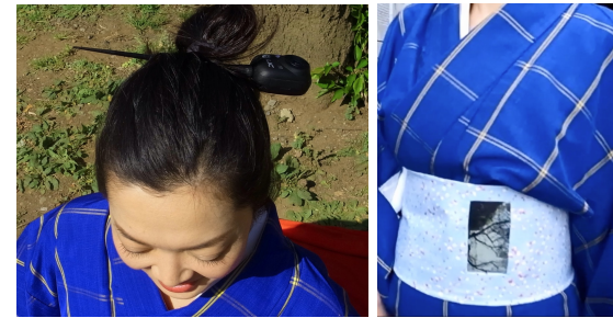
Figure 4: The Kanzashi hair piece with embedded camera adjusted to capture cherry blossom tree crowns on the left, and the camera view on the enhanced obi display on the right.

the obi display as a viewing opportunity for children. A lot of events in Japan where users wear traditional clothing require a high view point (most prominently cherry blossom viewing, fireworks or matsuri) and there tend to be a lot of people.