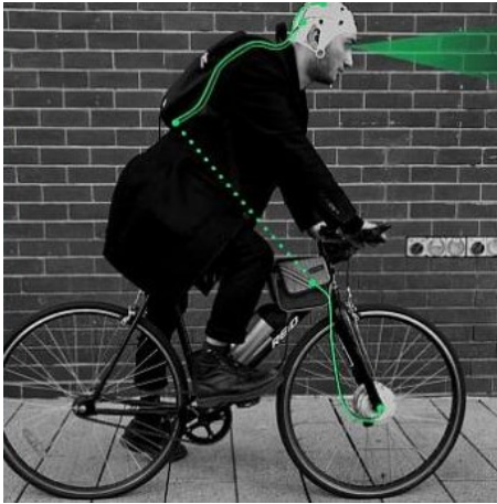
Figure 1: Ena, an e-bike which integrates with the riders visual cortex through EEG, allowing the bike to detect sudden changes in the riders peripheral vision. [1]

work, articulating a synthesis of contributions made toward Human-Computer Integration, summarised the contemporary state of the emerging paradigm. The paper defined HInt as “a new paradigm with the key property that computers become closely integrated with the user”, which included examples in which “humans and digital technology work together, either towards a shared goal or towards complementary goals (symbiosis)”; and “integration in which devices extend the experienced human body or in which the human body extends devices (fusion)”.