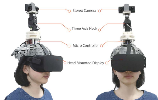
Figure 3: This wearable robot augments the wearers neck by expanding their range of visual motion in space, thereby influencing their visuomotor processes. [12]

Taken together, we suggest that in considering the growing deviancy in how HInt researchers talk about HInt, and the growing prevalence of theories outside of HInt that deal with the same themes, it is time to bring its leading experts back together. We argue the necessity to facilitate discourse between leading thinkers from diverse backgrounds with the audience to come to a shared vision and mutual understanding of what we talk about when we talk about human-computer integration.