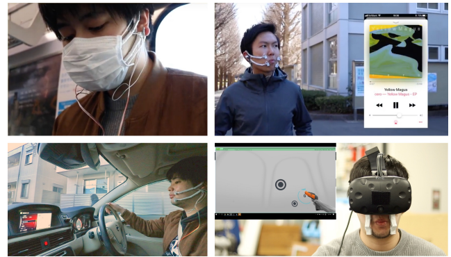
Figure 2: Make-a-Face used in various hands-free scenarios like (a) standing in a transit train with a mask, (b) running, (c) driving, and (d) gaming in VR

Based on our user experience, we found that Make-a-Face can be adapted to a wide variety of scenarios. We used Make-a-Face on everyday devices while performing activities like standing in a transit train and jogging to control our smart phone activity. To interact with a smart phone while being in transit, our device was especially useful for larger smart phones that occasionally require both hands to use, which can potentially be dangerous as one hand should be occupied on a handle at all times. For running, it was particularly useful to control our smart phone without the need to use our hands. We also developed a VR scenario that utilizes Make-a-Face for input and interaction, freeing our hands for other tracking and gesture activities. We believe it provides an especially