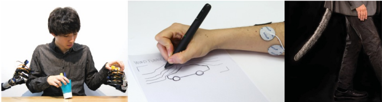
Figure 1. Exemplars of Human-Computer Integration: extending the body with additional robotic arms; [70] embedding computation into the body using electric muscle stimulation to manipulate handwriting [48]; and, a tail extension controlled by body movements [86].