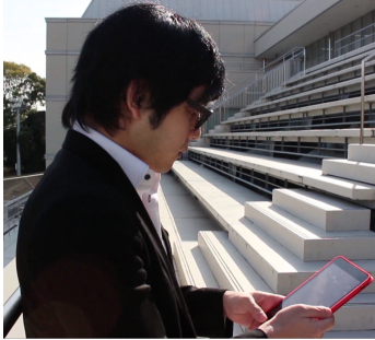
Figure 2: User wearing MEME while reading

We show a couple of demonstrations on an early prototype of J!NS MEME, smart glasses with integrated electrodes to detect eye movements. First, we depict a simple eye movement visualization, detecting left/right eye motion and blink. Users can play a couple of games in which they need to navigate/interact using eye movements. We detect and recognize reading and talking behavior of the user using a combination of blink, eye movement and head motion. People can get a long term view of their reading, talking, and also walking activity over the day. We can also give now detailed word count for the reading behavior and designed a couple of interactions related to ergonomics.