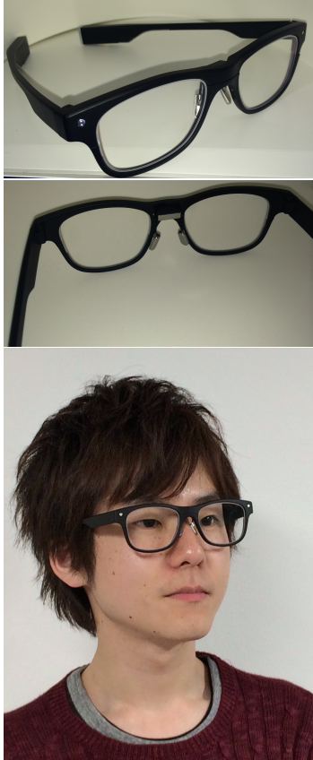
Figure 1: The EOG Glasses used for the experiments. The second picture shows the 3 electrodes touching each side of the nose and the area between the eyes. The last picture shows a user wearing JINS MEME.