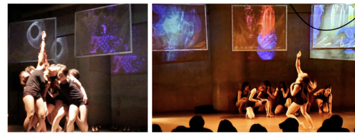
Figure 1: Visualizations while performers were dancing