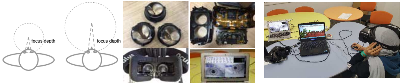
Figure 1. (a) Focus depth of the user where left is close and right is far, (b) Custom hardware, integrating a pupil labs tracker into Oculus, and (c) Experimental setup